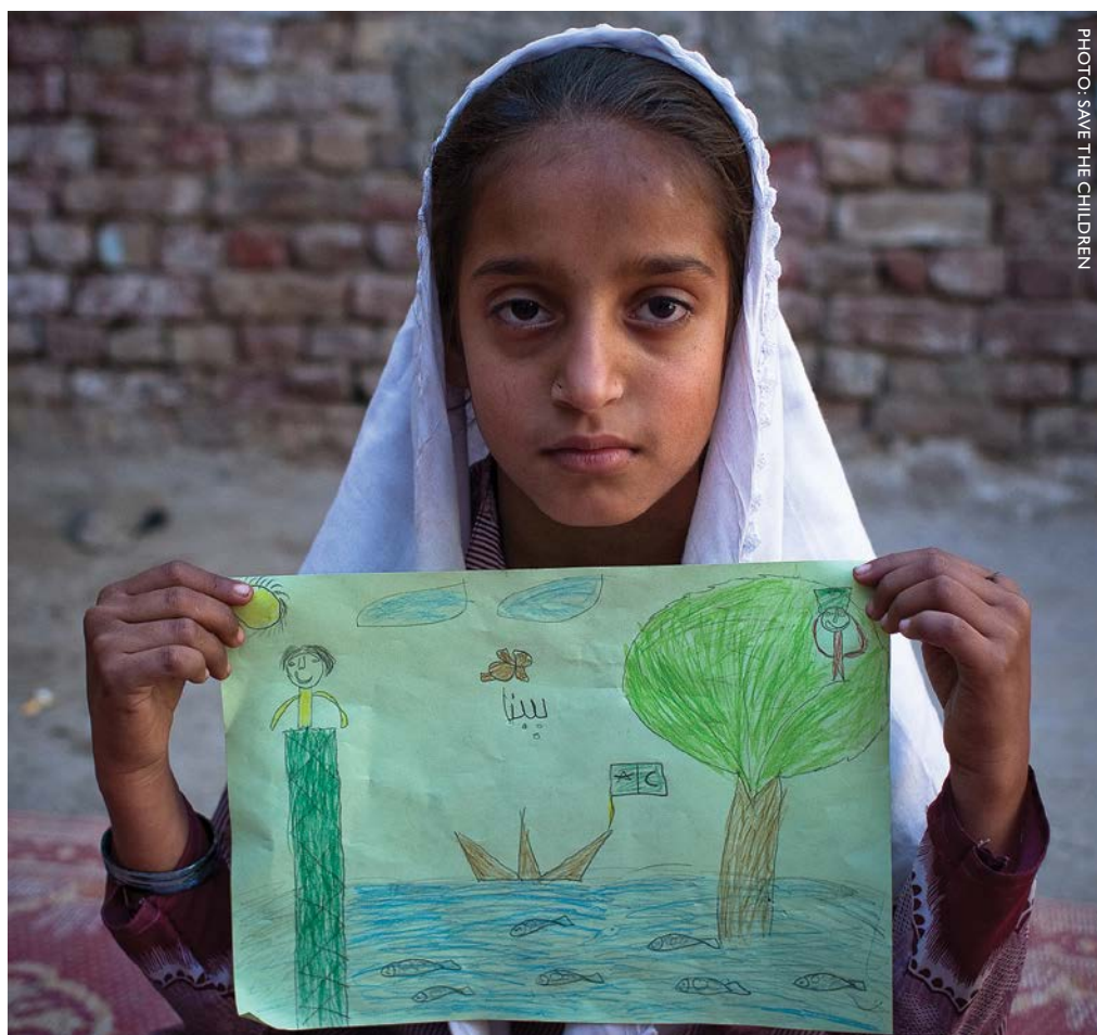
A girl holds up a drawing of what happened when her home in Pakistan was flooded, leaving her and her family stranded for days.