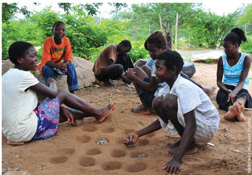
Children at a reception centre in Zimbabwe for unaccompanied children who have been deported from South Africa.