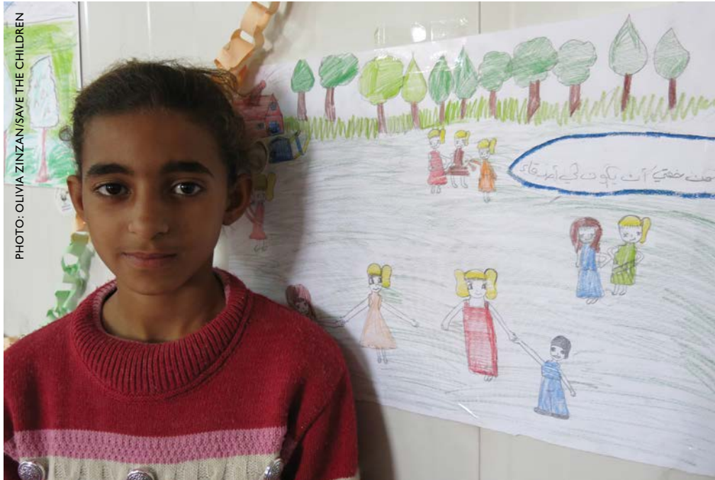
A child in a refugee camp in Iraq with a drawing she did to highlight children's rights for Universal Children's Day.